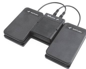
Hands-Free Page Turner