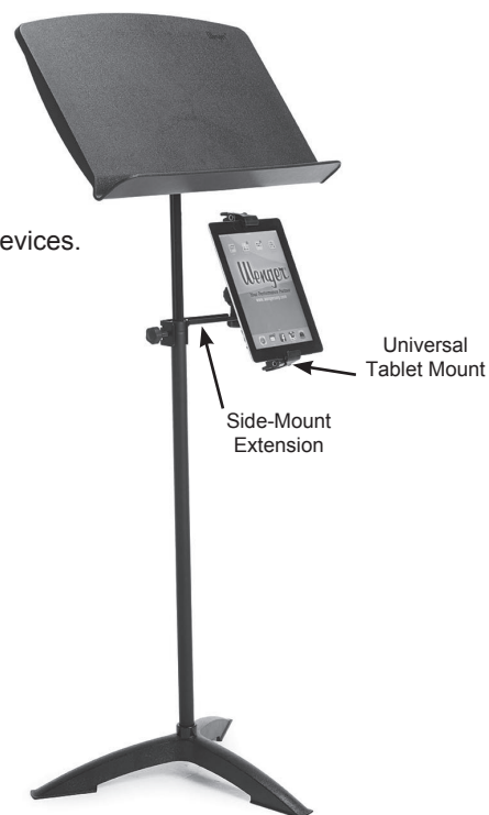
(shown on traditional music stand)