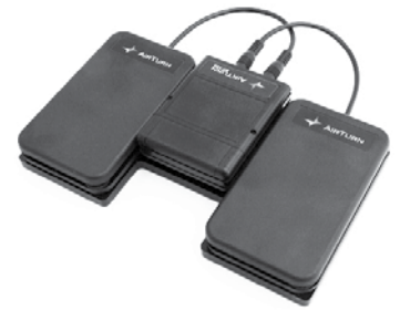
Hands-Free Page Turner