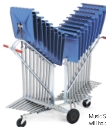
Music Stand Move & Store Cart will hold up to 18 Bravo Stands.

When it comes time to invest in music stands, the Bravo Music Stand gives you a lot more for your money. In fact you'll probably have to replace other music stands long before a Bravo retires.