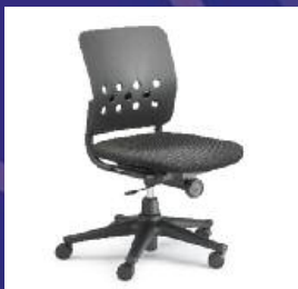
Workstation Chair Page 38

Roll your Music Posture Chairs wherever you need them, or store them safely away when you're done with them.