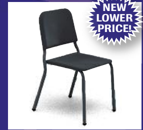
Student Chair Page 15

Posture chair design with extra padding for extra comfort.