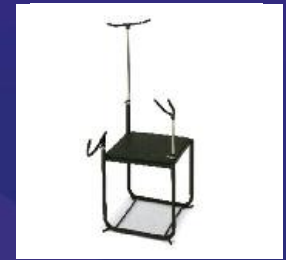
Sousaphone Chair Page 19

Always in demand, the Ensemble Stool features telescoping legs and a sealed natural wood seat.