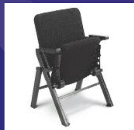
Portable Audience Chair Pages 124

Lightweight, adjustable and comfortable chairs that complement our electronic workstations for classrooms.