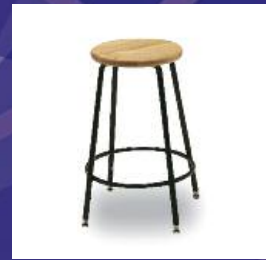
Ensemble Stool Page 18

Designed for beginning and younger musicians.