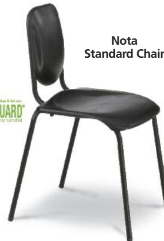
Nota Standard Chair