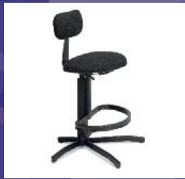
String Bassist/ Percussionist Chair Page 17

Specifically designed for cellists, with posture, stability and comfort in mind.