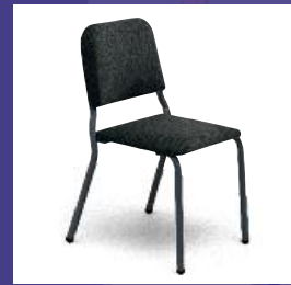
Musician Chair Page 14

Our newest posture chair innovation. No other chair can match it.