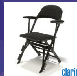
High-Density Portable Audience Chair by Clarin Page 125

A flexible alternative to fixed audience seating. Available in many widths and colors.