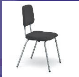
Playright Chair Page 18

Provides elevation to give the musician more control and the conductor more visibility from a seated position.