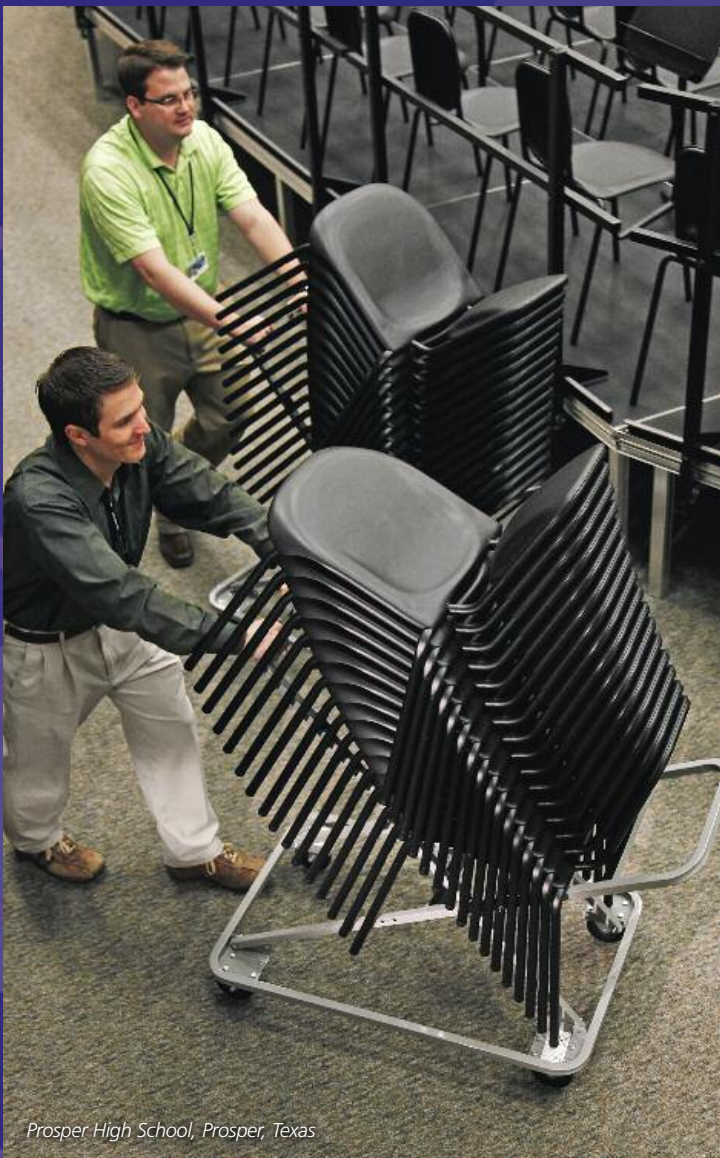
Prosper High School, Prosper, Texas