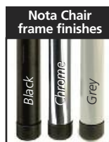
Nota Chair frame finishes