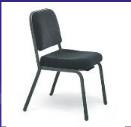
Symphony Chair Page 16

Classic black styling meets proper posture. Designed for concert halls and top-tier programs.