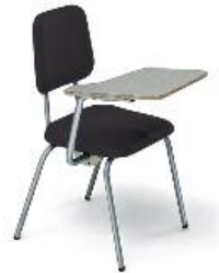
Shown with Tablet Arm option