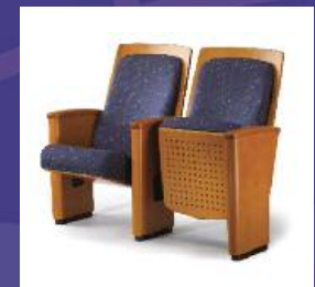
Fixed Audience Seating Pages 122-123

Portable audience seating that's easy to fold and store.