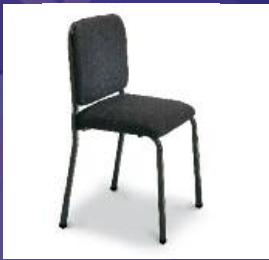
Cellist Chair Page 17

Specifically designed for cellists, with posture, stability and comfort in mind.