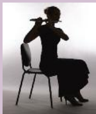
The Perched Position (forward)

No matter which position you or the conductor prefer, the Nota music posture chair is designed to keep your posture in the best possible place for performance and comfort.