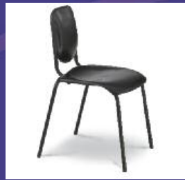
Nota® Standard Chair Pages 12-13

Upholstered, padded comfort and unmatched ergonomic benefits.