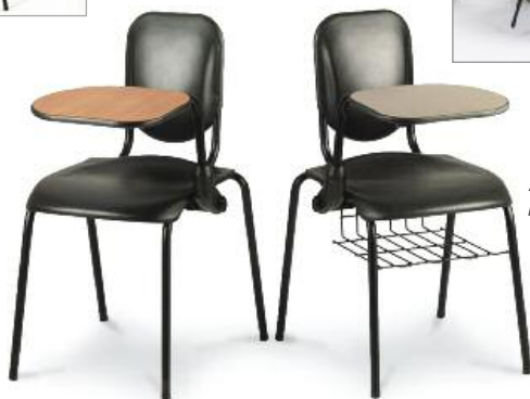
Universal Tablet Arms work left or right

Choice of color laminate tablets. Edging is black.