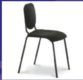
Nota® Premier Chair Pages 12-13

Classic black styling meets proper posture. Designed for concert halls and top-tier programs.