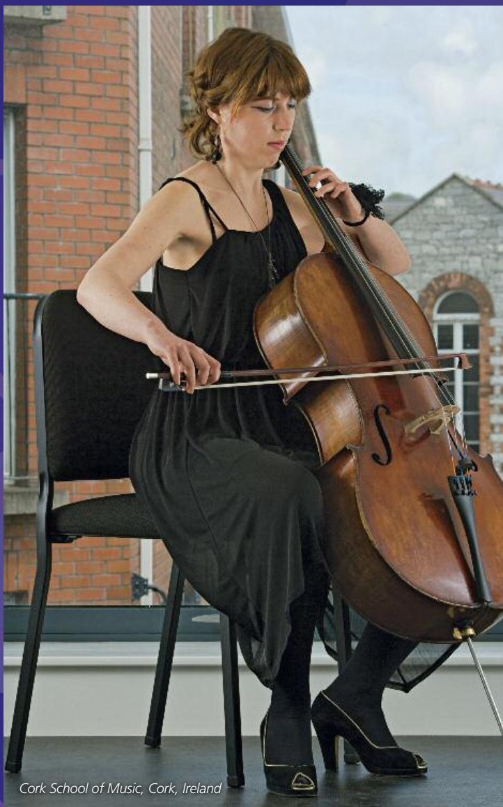
Cork School of Music, Cork, Ireland