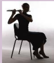
The Engaged Position (back)