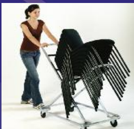
Chair Move and Store Cart Pages 15, 19

The original Wenger innovation! 65 years of allowing musicians to concentrate on technique.