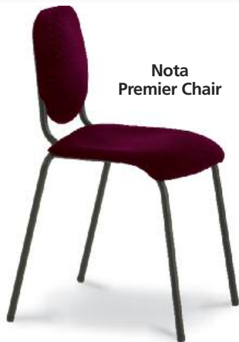
Nota Premier Chair