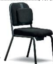
Adjustable Lumbar Pad