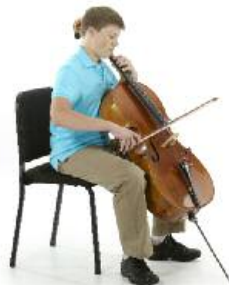
The Cellist Chair is specially designed to support the forward lean of a cellist.

0940000 Cellist Chair, 18 lbs (8.2 kg).....1-9 qty. $237ea.