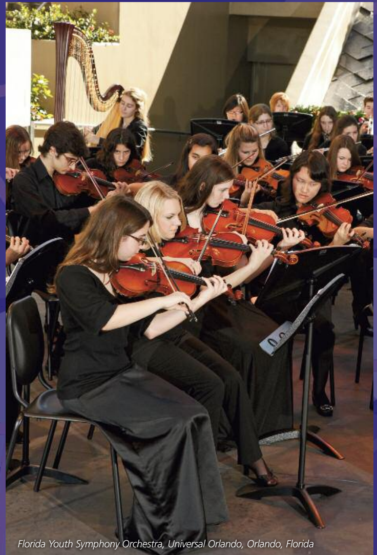
Florida Youth Symphony Orchestra, Universal Orlando, Orlando, Florida